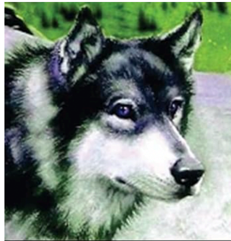
WHITE FANG JACK LONDON

The required summer reading books for all incoming 7th grade students are: